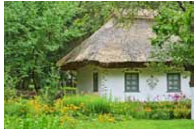
4. It's a country c _ _ _ _ .