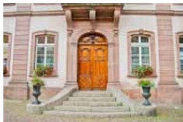
7. It's a r _ _ _ _ .